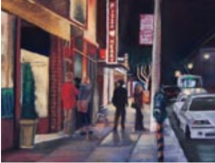
Pizza My Heart