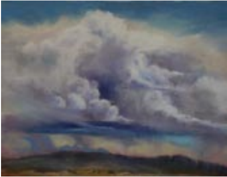
View from Double Eagle