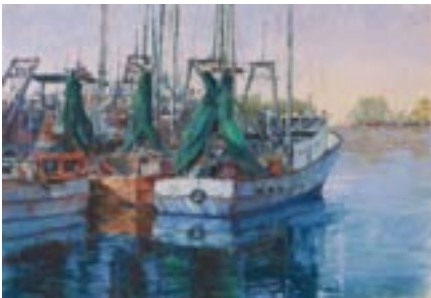
Rocky Point Shrimp Boats CHARLES "BUD" EDMONDSON

Albuquerque, NM Bill's Old Truck - $1,500 Rocky Point Shrimp Boats - $1,500 The Sky Above - $1,500