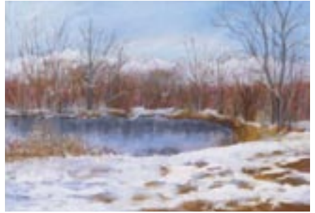
Winter at the Ponds