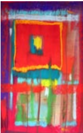
Red Square Abstract