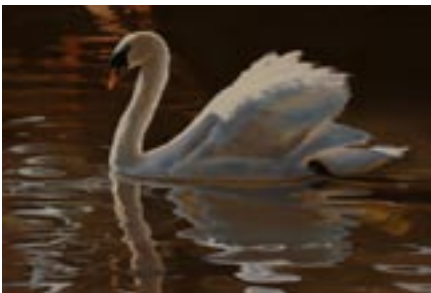
Following a Hard Day of Being a Swan

Following a Hard Day of Being a Swan - $725