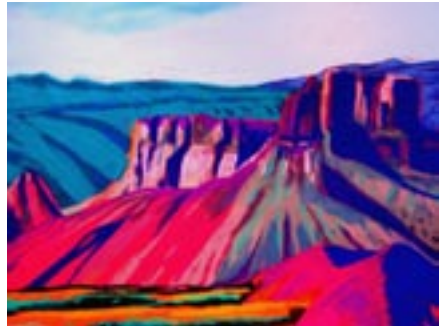
Georgia's Garden (top)