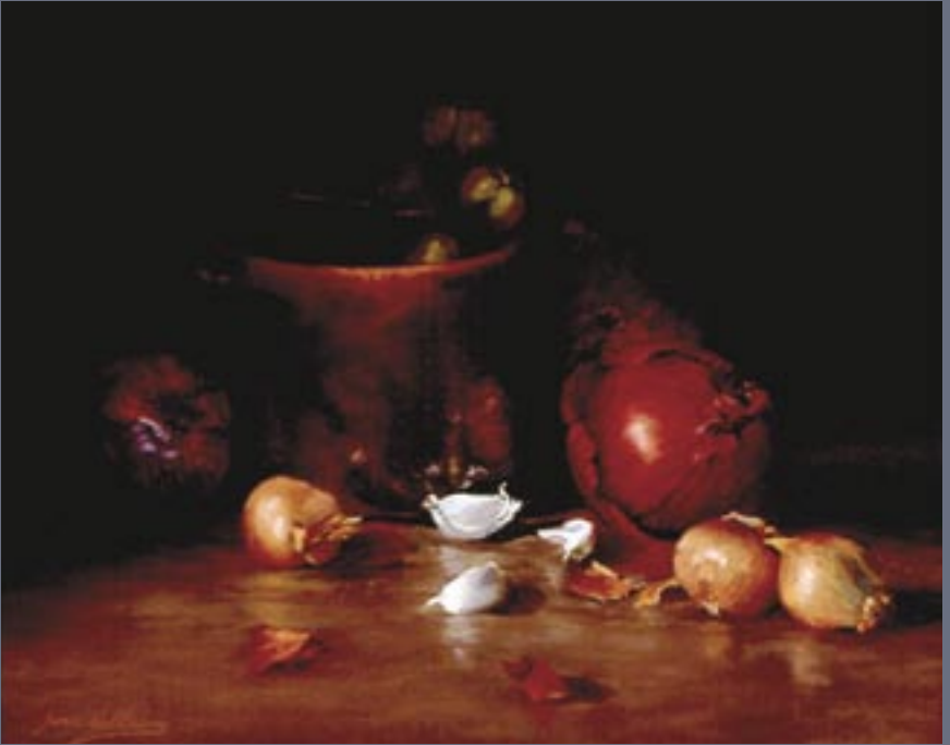
Still Life with Onion