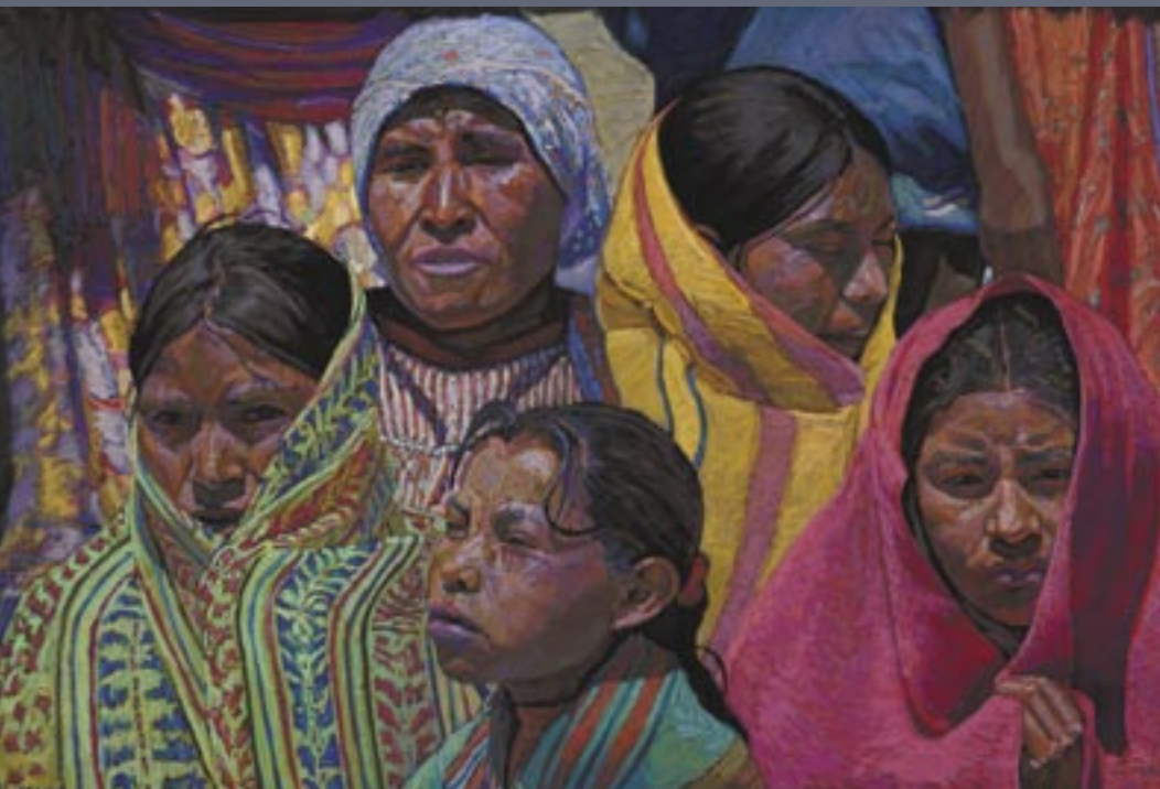
Faces (top) Looking On (bottom)