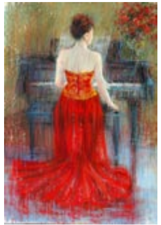
Piano Series - The Red Dress SEPTEMBER MCGEE