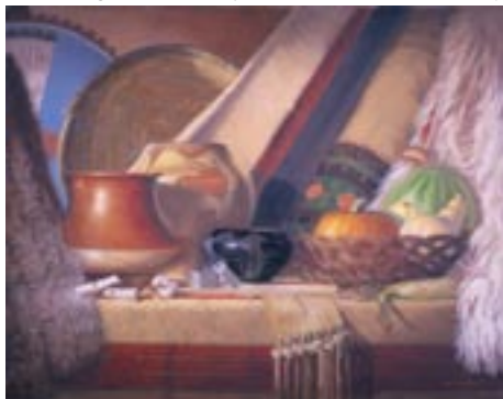
Honoring Centuries of Native Traditions, Carrying Old Traditions to a New World, and Blending Many Traditions to Form a Union